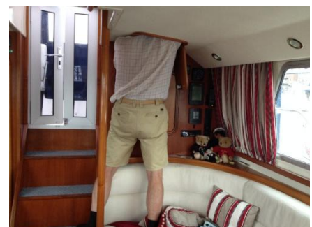
Commodore getting 'stuck in'

I have now moved the ICOM onto its own aerial using my second antenna on the radio arch which was being used by the