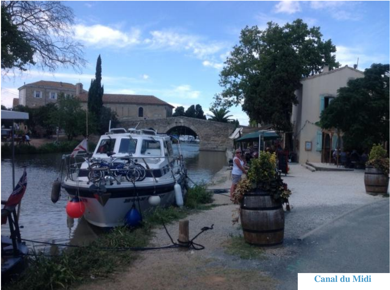
Canal du Midi

We got as far as Barcelona where we refuelled with white and stayed a month and decided yes we like Spain. Then heading back north into France, we had friends to meet at Toulouse. July and Aug was spent travelling along the Canal du Midi dodging hire boats as far as Toulouse and